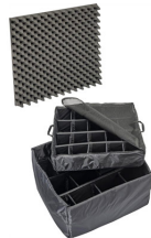
1635 Padded Divider Set