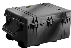
1630NF No Foam