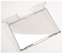
1630DC Document Container Accessory