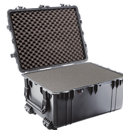
1630WF With Foam