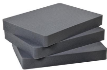
1632 Pick N Pluck™ Sections Only (set of 3)