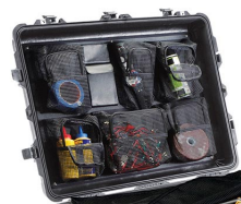
1639 Lid Organizer