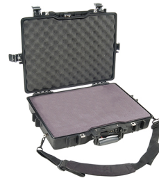
1495WF With Foam