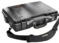
1495NF No Foam