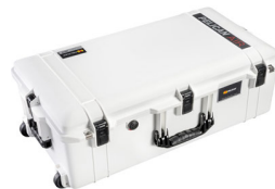
1615WWF With Foam