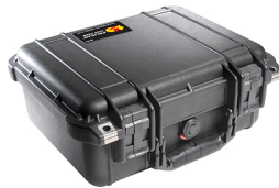
1400NF No Foam