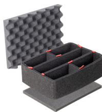
1400TPKIT TrekPak Case Divider Kit