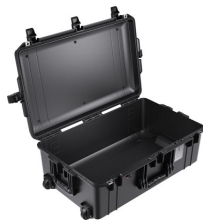
1595NF No Foam