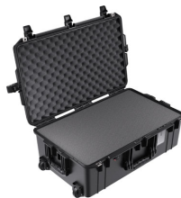
1595WF With Foam