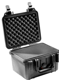
1300WF With Foam