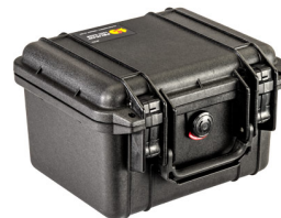
1300NF No Foam