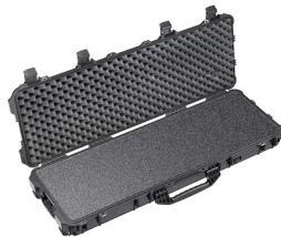
1720WF With Foam