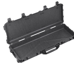
1720NF No Foam