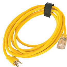
9606 Power Cable