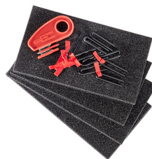
1506TPKIT TrekPak Case Divider Kit

23215 Early Ave • Torrance, CA 90505 USA • Phone: (310) 326-4700 • (800) 473-5422 • Fax: (310) 326-3311 sales@pelican.com • www.pelican.com