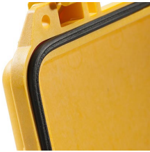
1603 Replacement O-ring