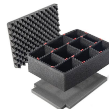
1500TPKIT TrekPak Case Divider Kit