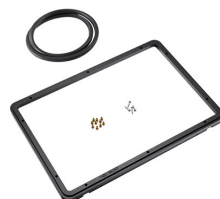
1450PF Special Application Panel Frame