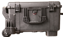
1620MNF No Foam