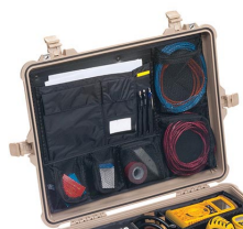
1609 Lid Organizer