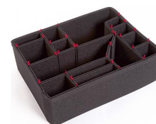
1610EUTP TrekPak Case Divider Kit