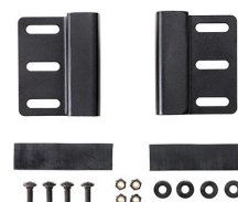
LGMT-001P Protector Case Roof Mount