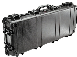
1700NF No Foam