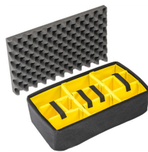
1515 Padded Divider Set