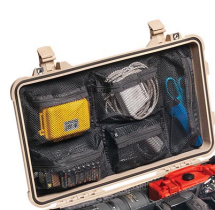
1519 Lid Organizer