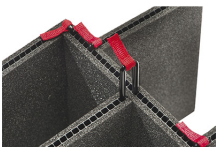
iM2620-TREK TrekPak Case Divider Kit