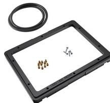
1200PF Special Application Panel Frame