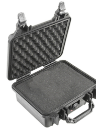
1200WF With Foam