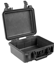
1200NF No Foam